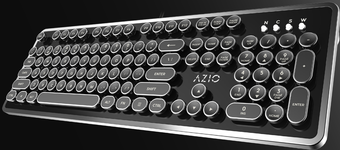
AZIO MK RETRO